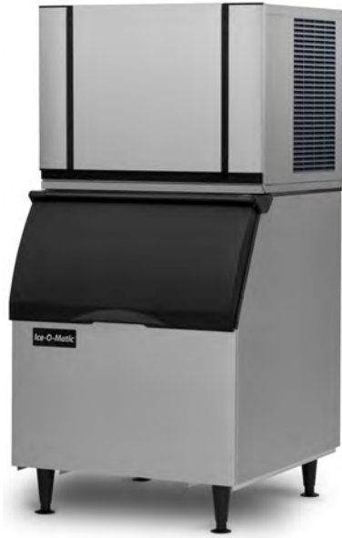
CIMO435 ON B40