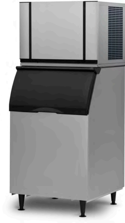
CIMO635 ON CIB230