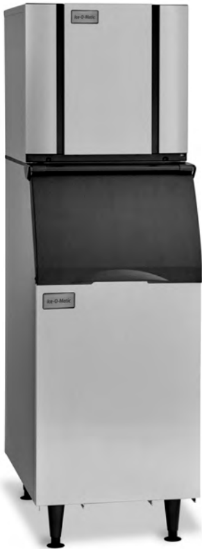
CIMO825 ON B42