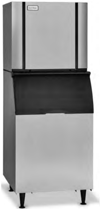
CIMO835GA ON CIB230