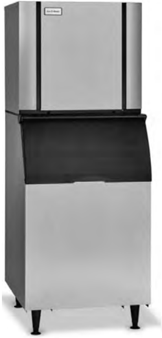
CIM1135 ON CIB230