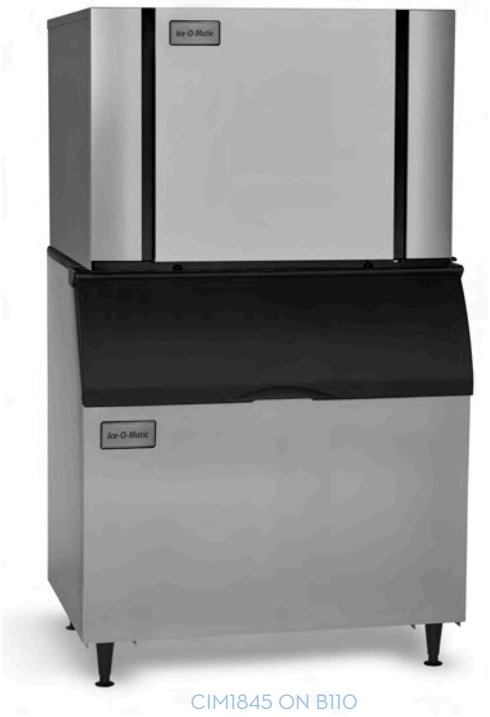
CIM1845 ON B110