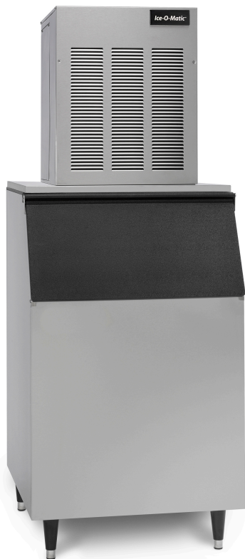
MFI1255 ON CIB230